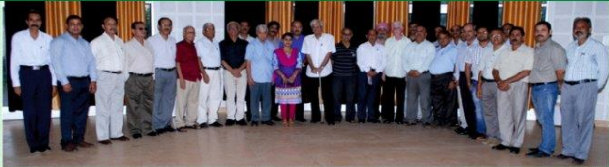
Engineers posing for a photograph after paying rich tributes to Bharat Ratna Sir Mokshagundam Visvesvaraya on his 153 rd Birth Anniversary on 47 th Engineers' Day in the Institution's Auditorium.

A large number of engineers assembled at The Institution of Engineers (India), Jammu Local Centre to pay tributes to Bharat Ratna Sir Mokshagundam Visvesvaraya on his 153 rd Birth Anniversary which was observed all over the country as 47 th Engineers' Day. Pertinently, against the usual gaiety which marks the occasion, the day was observed with extreme solemnity and simplicity in view of the extensive loss of life and property due to recent unprecedented floods in the J&K State.