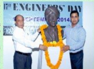
Chairman & Hony. Secretary of Jammu Centre garlanding the bust of Sir M. Visvesvaraya on 47 th Engineers' Day.

While paying glowing tributes to Sir Mokshagundam Visvesvaraya, Engineers present on the occasion condoled the loss of life and property due to recent natural calamity in J&K State and also observed 02 minute silence as a mark of respect in memory of those who lost their lives. Dedicated services of Engineers working in NDRF, Indian Army, Indian Air Force, Indian Navy, J&K Police and other Para Military Forces were also applauded on this occasion due to their working round the clock in rescuing the people marooned and stranded in water in floods in various parts of J&K State.